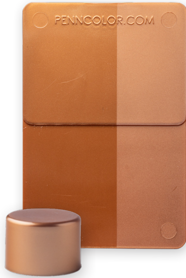
BRONZE 60R6524 @ 4% PP