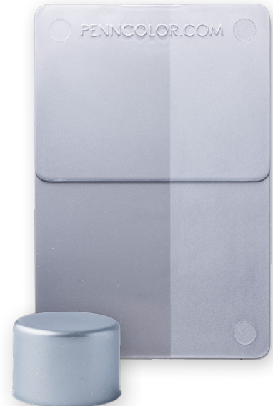
SILVER SPARK 62ZP20705 @ 4% PP