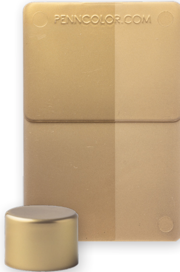
GOLDEN 62YP20516U @ 4% PP