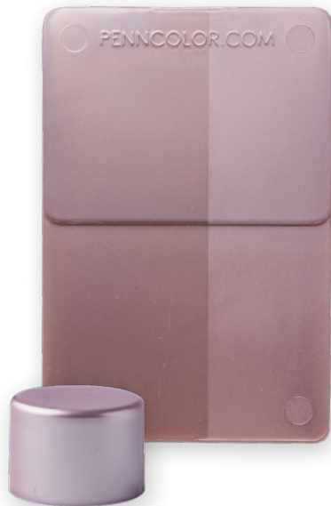
ROSE GOLD 60RP7347U @ 4% PP