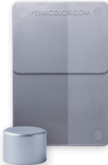
CHROME 62AP20706 @ 4% PP