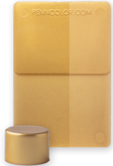
GOLD 62YP20704 @ 4% PP